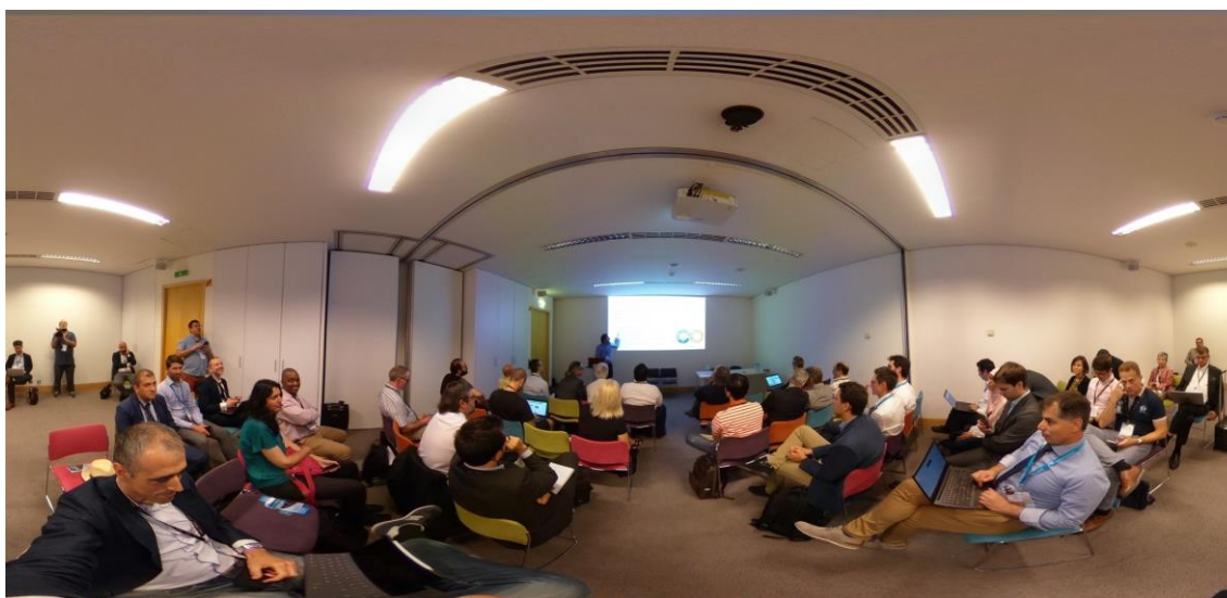
FIGURE 4: 360-DEGREE PICTURE

A lot of people attended the workshop, with the room fully packed and several people coming in and out. A 360 picture taken at a one moment of the workshop is shown in Figure 4, where more than 40 people is present. We counted a total of 52 different attendees in total during the workshop 2 .