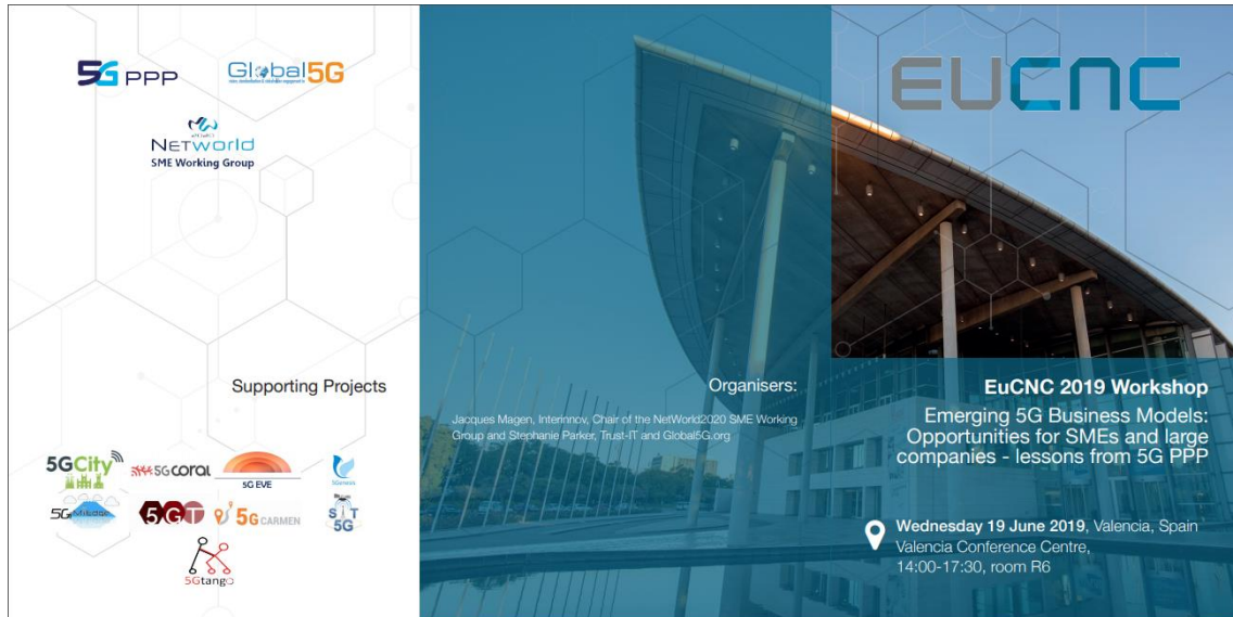
FIGURE 1: WORKSHOP LEAFLET (PART ONE)